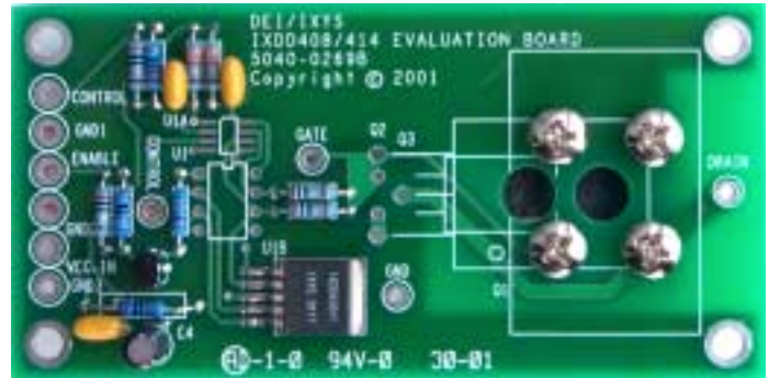
Figure 1 - EVDD408/EVDD409/EVDI409/EVDN409/EVDD414 Evaluation Board SOT-227 Device Installed For Illustration Purposes Only

There are three test points on the board: Control, Gate and Drain. These allow the user to easily attach an oscilloscope probe and the associated ground to the circuit to verify performance.