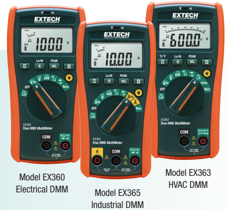
Model EX360 Electrical DMM

True RMS provides accurate readings when measuring distorted or noisy waveforms. Choose a model designed for Electrical, HVAC, or Industrial Applications. Advanced LoZ feature eliminates false readings caused by ghost voltages. CAT IV safety rating ensures the highest level of protection.