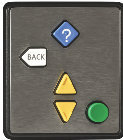
5 Key Layout

Storm Nav-Pad™ keypads are constructed to survive in exposed or hostile outdoor environments the keypads will withstand heavy use and abuse. They are sealed against the ingress of liquids and dust to survive regular wash down and sanitation procedures. Nav-Pad™ keypads feature an optional integral USB interface to ensure hassle free, single cable connection to the host system. (Please note: The USB cable is supplied 'hard-wired').