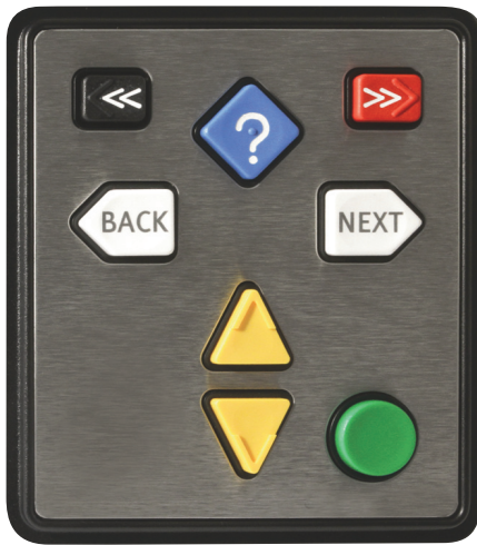
8 Key Layout