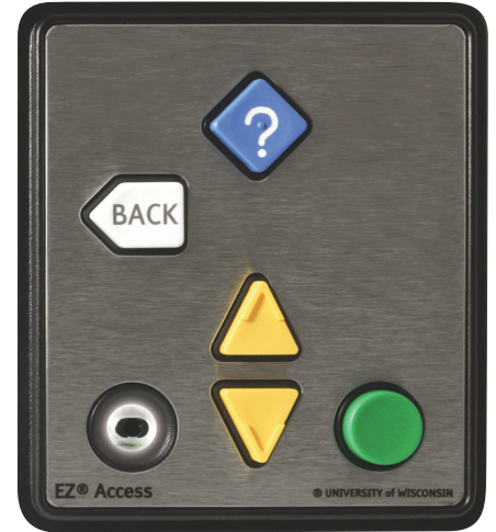
5 Key, USB interface