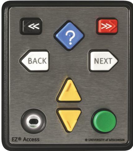
8 Key, USB interface

with audio processor and illuminated audio jack socket