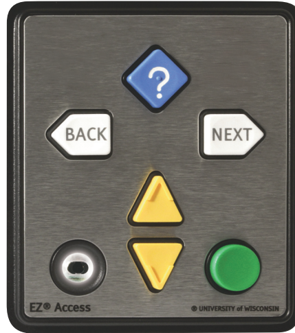
6 Key, USB interface