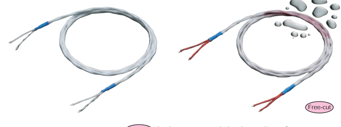
Free-cut Indicates models that allow free cutting.