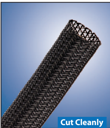
Cut Cleanly Hot Knife