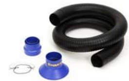
C1572 Duct Kit