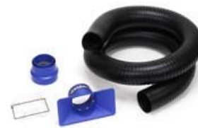
C1571 Duct Kit