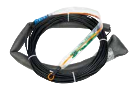
3M<sup>™</sup> External Cable Assembly Module (ECAM) Factory Terminated Fiber Cable Assembly (FCA)