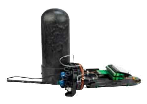
3M™ Fiber Dome Stubbed Terminal FDST 08S

The FDST 08S terminal features a fixed O-ring sealing system along with an innovative latching mechanism. This combination provides simple, virtually error-free terminal sealing and re-entry. Also, the re-entry feature allows easy access to clean and repair connectors and replace the terminal or terminal tail in the event that either of these are damaged.