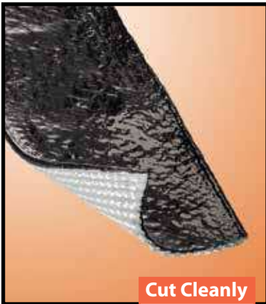
Cut Cleanly Scissors