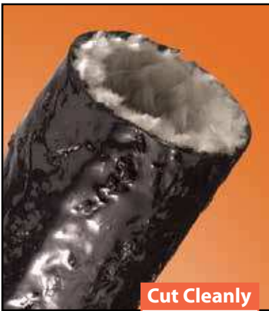
Cut Cleanly Scissors

Material FIN Silicone Jacketed Fiberglass