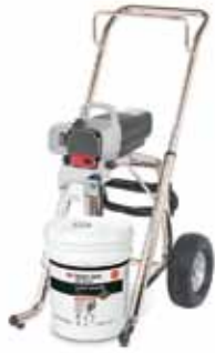
Sag-resistant, highly elastomeric formula for construction joints (airless sprayer sold separately).