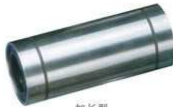
加长型 Long type