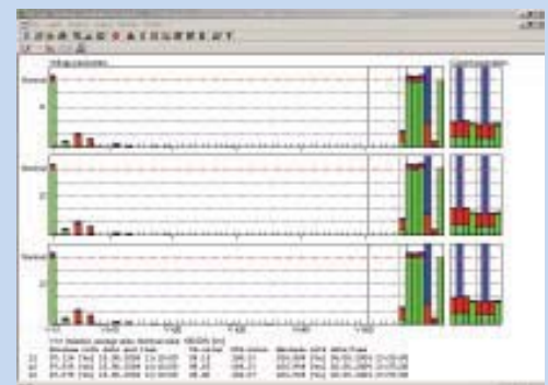
Statistical analysis of Voltage and Current harmonics over a given time period. Red bar graphs indicate issues with the grid. Other colors are warnings for potential future issues. Harmonics can be presented also as time plots.