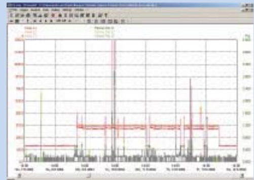
For root cause analysis, different measurements such as flicker, voltage and THD can be shown in the same time plot, helping to quickly identify the cause of a disturbance.

With its easy-to-use interface, the included PQ Log software assists you with logger setup, enables you to verify actual measurement values quickly using the online function, and downloads data from the logger to a connected PC operating on standard Windows® operating systems. You can view the logged data in graphical and tabular form, export it to a spreadsheet, or generate a professional report with the Report Writer function.