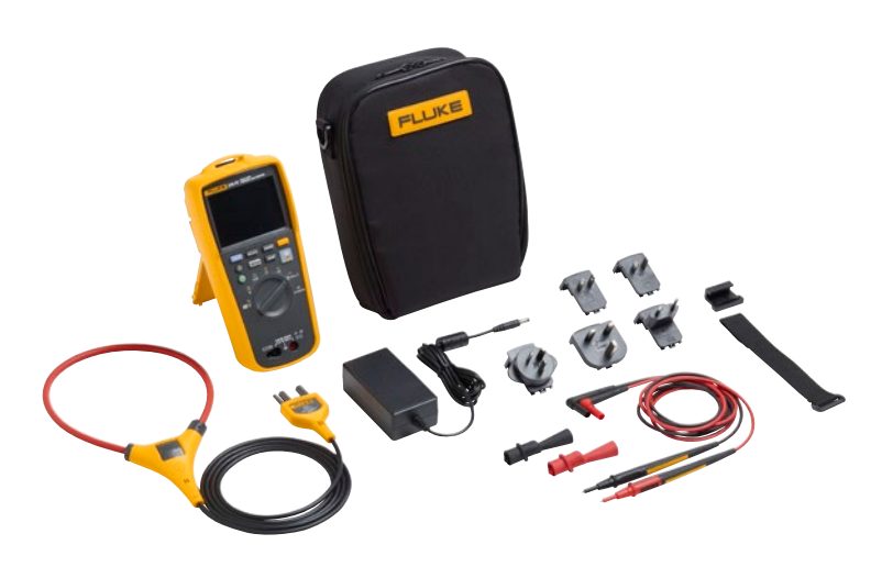
Figure 2. Fluke 279 FC/iFlex TRMS Thermal Multimeter Kit