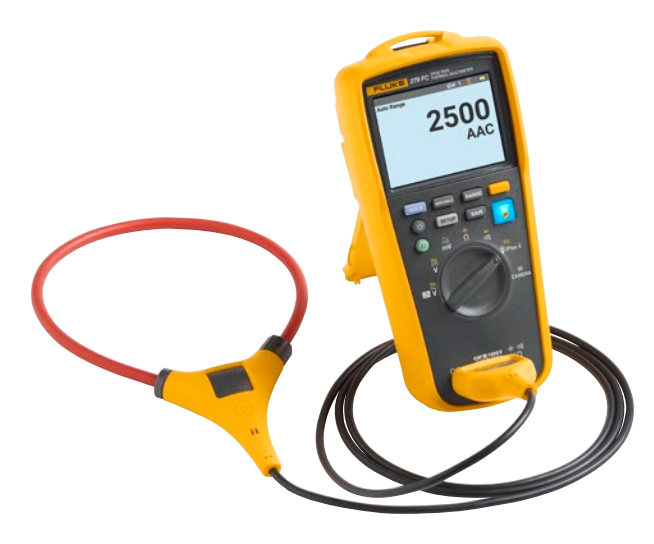
Figure 1. Fluke 279 FC with the iFlex Flexible Current Probe