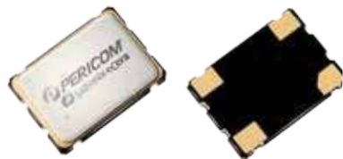
7.0 x 5.0mm Ceramic SMD