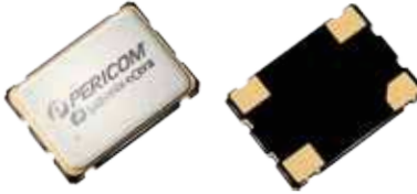
7.0 x 5.0mm Ceramic SMD