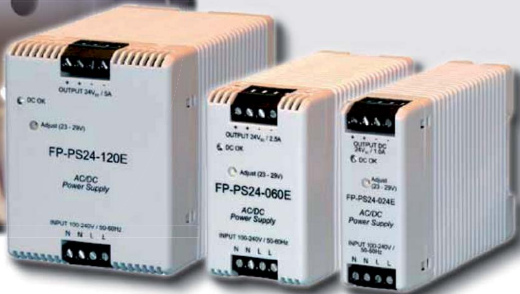
FP-PS24-120E 5.0A/24V DC