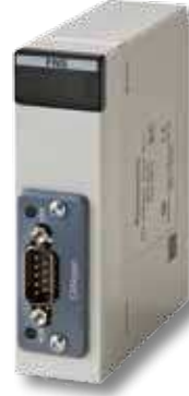
Slave units for CANopen FP2-CAN-S FPG-CAN-S