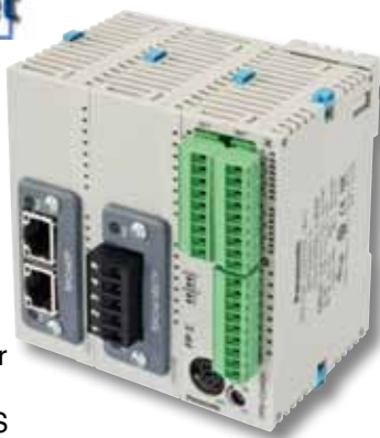
Slave units for BACnet FPG-BACIP-S FPG-BACMSTP-S