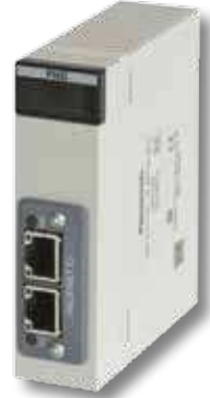
Slave units for PROFINET IO FP2-PRT-S FPG-PRT-S