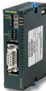
Slave unit for PROFIBUS DP (FP0/FP0R expansion unit also compatible with FP-X) FP0-DPS2