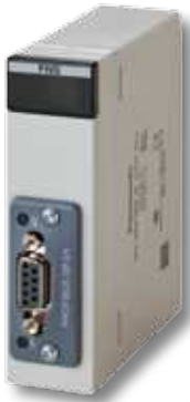
Slave units for PROFIBUS DP FP2-DPV1-S FPG-DPV1-S