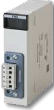
Slave units for DeviceNet FP2-DEV-S FPG-DEV-S