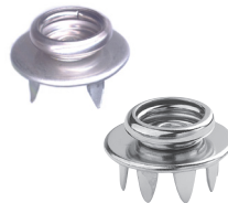
FPSNAP and 3050

Prong Clinch snaps are held in place by pushing the prongs through the mat and crimping them on the bottom of the mat.