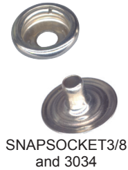
SNAPSOCKET3/8 and 3034

Socket snaps are held in place by crimping the tip of an eyelet through the center of the socket with a snap tool. This traps the mat between the socket on the top of the mat and the eyelet on the back of the mat. 10 sockets and eyelets are included in each pack.