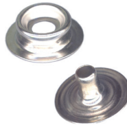
SNAPSTUD10 3/8 and 3033

Stud snaps are held in place by crimping the tip of an eyelet through the center of the stud with a snap tool. This traps the mat between the stud on the top of the mat and the eyelet on the back of the mat. 10 studs and eyelets are included in each pack.