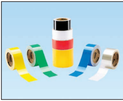
Printable Floor Tape