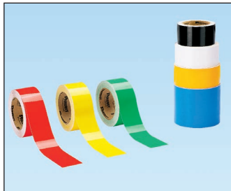
Solid Color Floor Tape