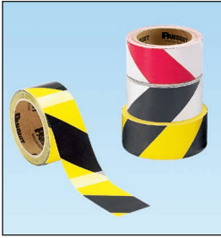
Striped Floor Tape