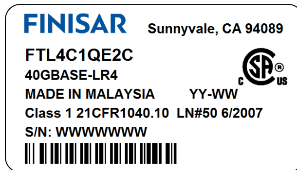
Figure 3 – FTL4C1QE2C production label