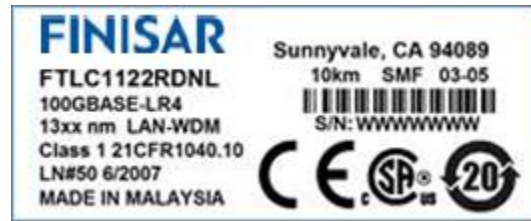
Figure 2. Standard Product Label