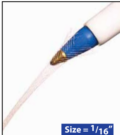
Size = 1/16"