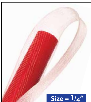
Size = 1/4"