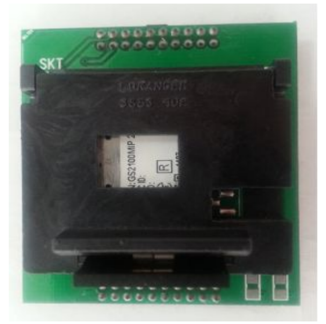
Programmer: SuperPro 7100