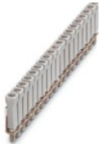
Jumper, Number of positions: 100, Color: gray

Please be informed that the data shown in this PDF Document is generated from our Online Catalog. Please find the complete data in the user's documentation. Our General Terms of Use for Downloads are valid ( http://download.phoenixcontact.com )