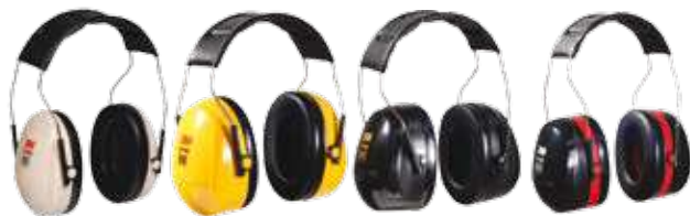
3M Peltor Optime Earmuffs: A market standard

3M Peltor Optime Earmuffs offer versatile protection that meets the needs of a majority of workplace applications.