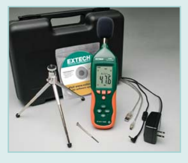
Meter and accessories are packaged in a rugged hard carrying case for added protection