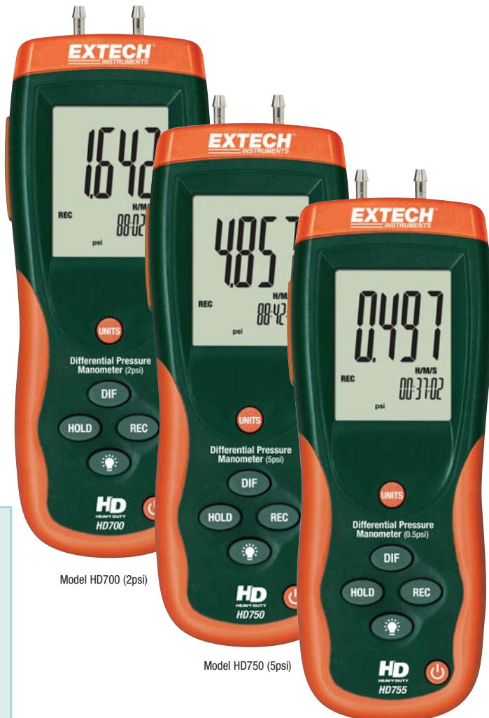
Model HD700 (2psi)