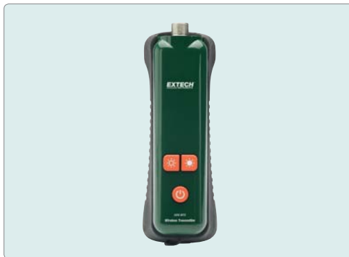
HDV-WTX Universal wireless handset, accepts several scopes of varying diameters, lengths, and flexibility