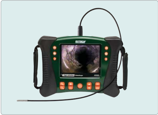
HDV610 VideoScope with 5.5mm diameter flexible probe (1m length)