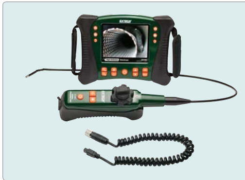
HDV640W VideoScope, wireless handset & 6mm diameter semi-rigid articulated (240°) probe