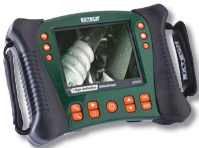
HDV600 Display Unit

You may also configure customized solutions by starting with an HDV600 display unit (no probe included) and selecting optional probes and/or handsets listed above.