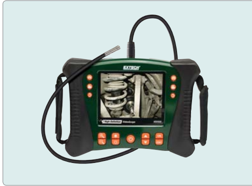
HDV620 VideoScope with 5.8mm diameter semi-rigid probe (1m length)