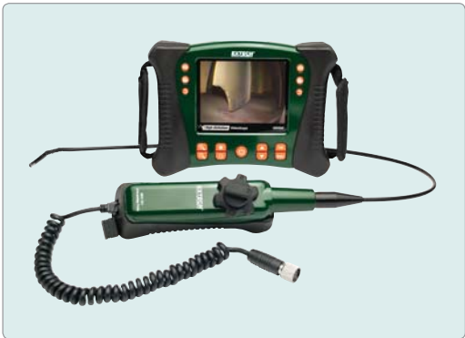
HDV640 VideoScope, wired handset & 6mm diameter semi-rigid articulated (240°) probe