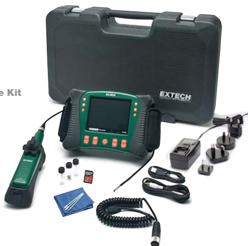
HDV640 Complete Kit

The HDV600 series is designed with capabilities and accessories to give you a rolling start while still permitting you to expand functionality as your needs change.