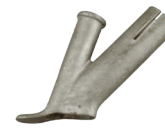
Welding Nozzle 2.6" x 1.2" x .5" No. 07531