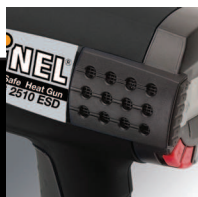
Dual Air Filters