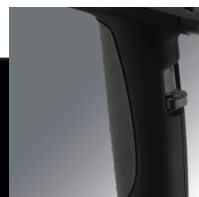
Soft Grip Handle