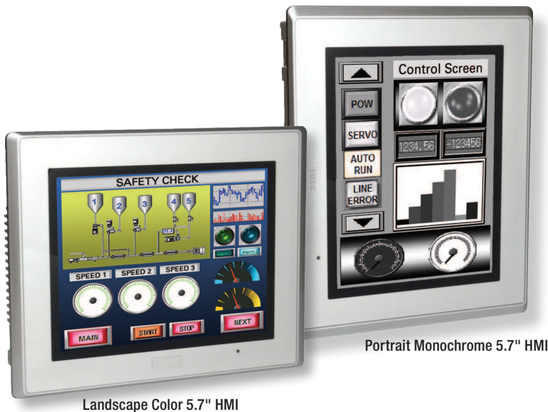
Landscape Color 5.7" HMI