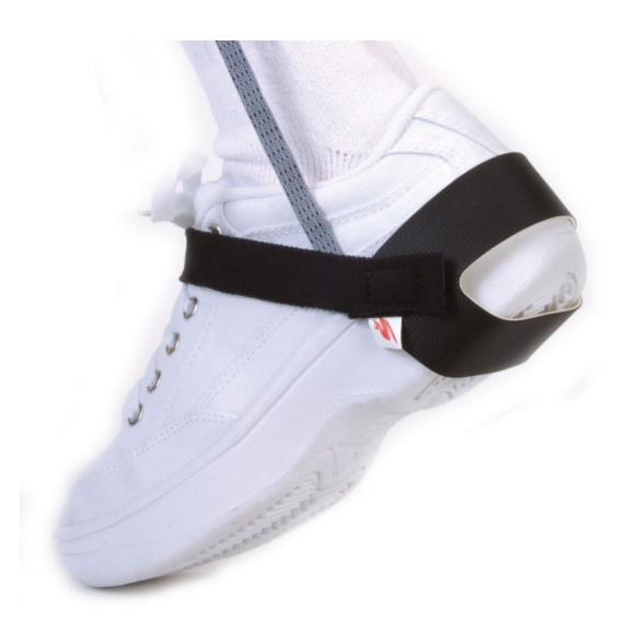
Elastic Hook and Loop Strap for Comfort and Visibility