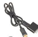
ADAPTER CABLE FOR APPLE® [optional] 78-6872-0034-9