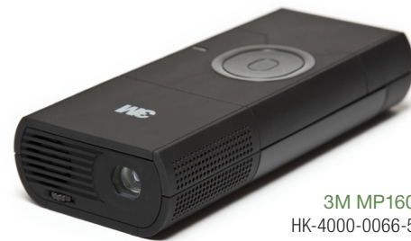
3M MP160 HK-4000-0066-5