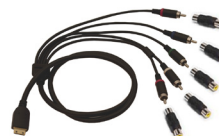
COMPONENT AV CABLE [optional] 78-6972-0032-3