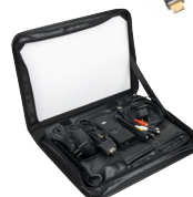
PORTABLE PRESENTATION BINDER [optional] 78-6969-9997-4