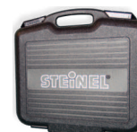
Heavy Duty Carrying Case 14.5" x 4.0" x 14.0" No. 40100