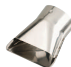
50 mm Window Nozzle 2.2" x 2.2" x 1.4" No. 07031