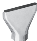
75 mm Spreader Nozzle 3.1" x 3.0" x 1.4" No. 07021