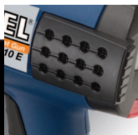
Dual Air Filters