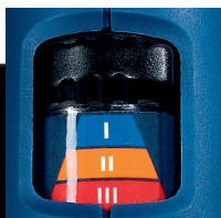
3 Stage Switch: Cool / Low / High