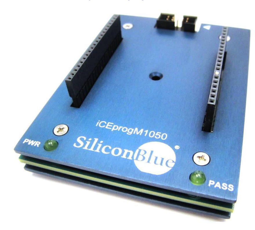
Figure 1: iCEprogM1050-01

To Socket Adapter for iCE65 NVCM programming