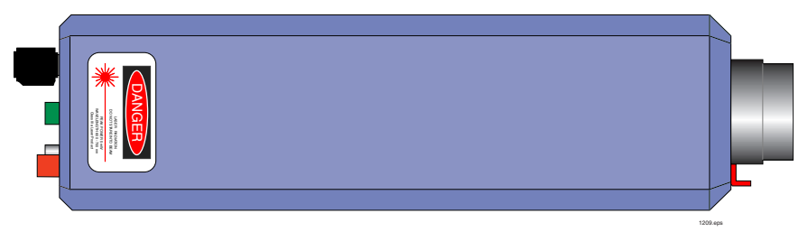
Figure 7. Top view of laser showing the location of the "Warning logotype" label for a Class IIIa laser.

For U.S. guidelines on laser classifications and health standards, refer to the American National Standards Institute specifications governing lasers and laser safety. The guidelines are published by the Laser Institute of America, 12424 Research Parkway, Suite 130, Orlando, FL 32826.