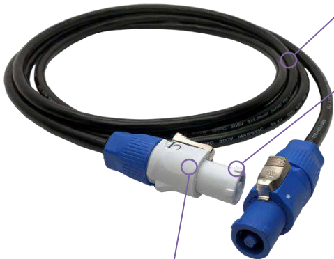
IO-PRCPTP-14-10 (left) IO-PRCPTE-14-25 (right)

Each connector is keyed differently to eliminate the possibility of inter-mating. Locking mechanism virtually eliminates accidental unplugging