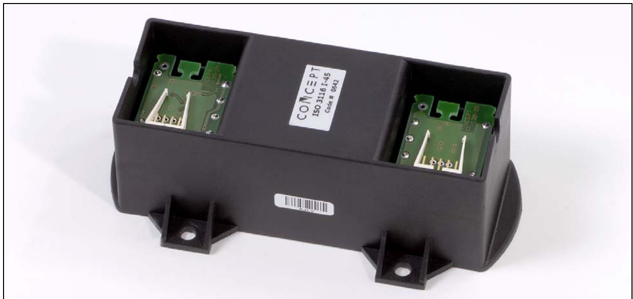
Fig. 1 Power Supply ISO3116I

For drivers adapted to various types of high-power and high-voltage IGBT modules, refer to www.IGBT-Driver.com/go/plug-and-play