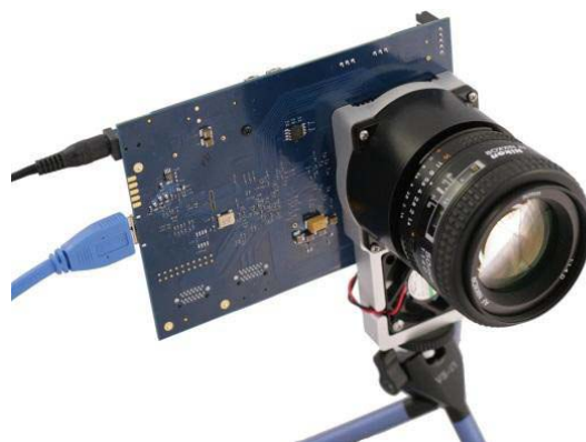
Figure 1. Evaluation Board Picture