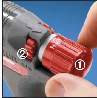
① Coarse Adjustment Knob ② Fine Adjustment Knob

Step 2: Use Fine Adjustment Knob to set and maintain desired tension