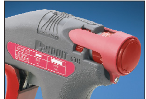
Optional Tension Lockout Kit