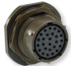
KPT | MIL-DTL-26482 Series I

KPT/KPSE connectors conform to MIL-C-26482 with a positive three point bayonet coupling, five-keyway polarization and high insert arrangement contact density. They are environmentally sealed, fully intermateable and accept a wide range of interchangeable accessories.