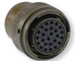
KPSE | MIL-DTL-26482 Series I / VG95328