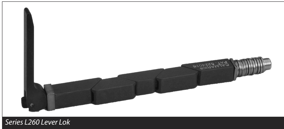
Series L260 Lever Lok