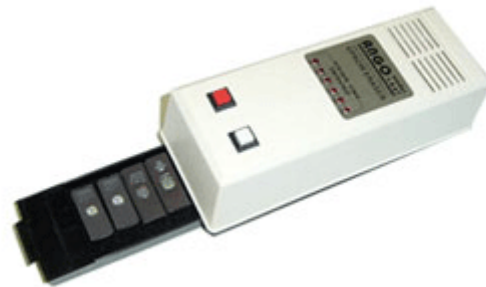
EPROM Eraser w/ Electronic Timer, Holds 9 devices