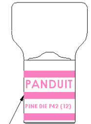
Color coded barrel markings