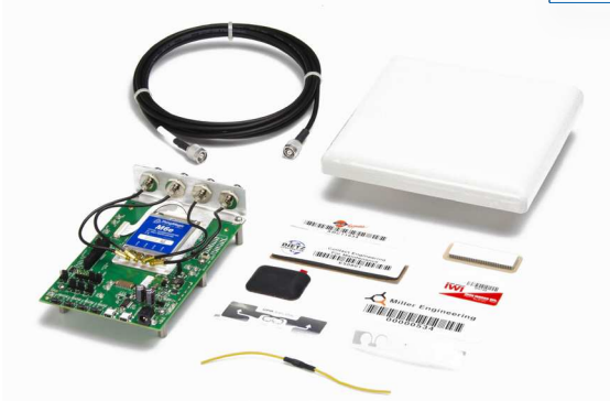
M6e Reader DevKit shown