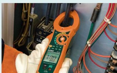
2.0" (52mm) jaw size for conductors up to 500MCM