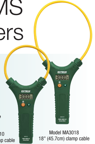
Model MA3018 18" (45.7cm) clamp cable