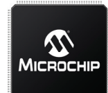
144-lead LQFP (PL) 20 × 20 × 1.4 mm