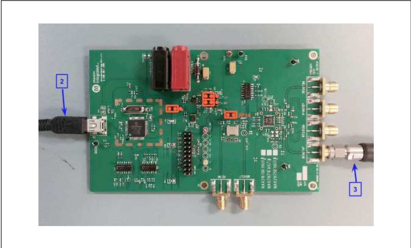
Figure 1. MAX2870/MAX2871 EV Kit Hardware Connection