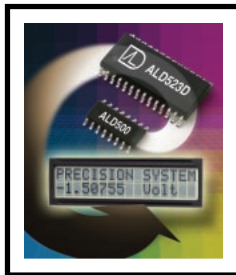
Chipset consisting of ALD500 Integrating Analog Processor and ALD523D Display Module Controller